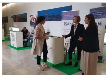
Sponsors Booths 2x2 m

Do you have additional ideas for other forms of partnerships than those proposed? Tailor-Made sponsorship