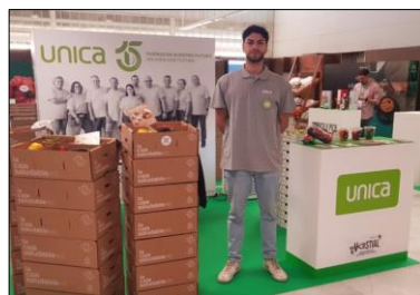
Sponsors Booths 3x3 m